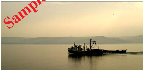
(Above) Sea of Galilee looking East toward the Golan heights. The location from which this photograph is taken is Nof Ginasor, called Gennesaret in Matthew 14:34.