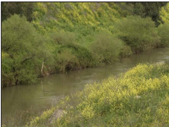
(Above) Jordan River north of the Sea of Galilee near Kfar Blume.