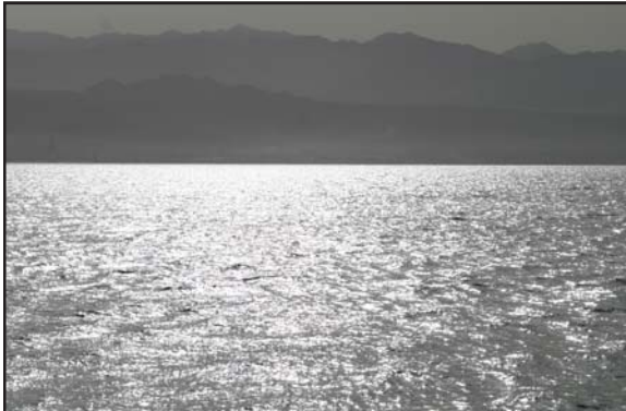
Above) Red Sea looking East From Israel across to Jordan & Saudi Arabia.